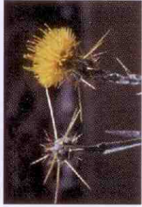
Wildlife habitat, wilderness, and recreation areas invaded by yellow starthistle.

Invasive noxious weeds have been described as a raging biological wildfire—out of control and spreading rapidly. The devastation from these alien plants includes enormous economic losses to agriculture and irreparable ecological damage to wildlands. Millions of acres have been invaded or are at risk, including rangelands, forests, wilderness areas, national parks, recreation sites, and wildlife management areas.