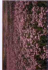
Permanent change in wildland plant and animal community caused by noxious weeds.

When considering long-term ecological effects on the land, invasion by aggressive non-indigenous noxious weeds is far more damaging than any wildfire.