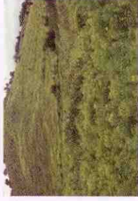
Leafy spurge infestation out of control and expanding.

Wildfire prevention depends on widespread public awareness and concern achieved through a balance of education and regulation. Fire prevention messages appear in a variety of forms and places to remind people of the critical role everyone plays in this effort. Regulations such as campfire restrictions contribute significantly to wildfire prevention.