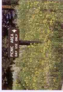
Picnic areas and campgrounds overrun by St. Johnswort.

Wildfires and weeds share much in common, including impacts, spread, and management.