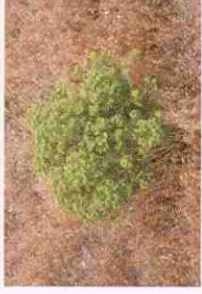
Single leafy-spurge plant—the beginning of a new noxious weed infestation.

Weed infestations enlarge and spread much like wildfires, beginning small, then expanding to cover huge areas if not controlled quickly. Weed seeds, like embers, can be carried long distances by wind or other means. The resulting new "spot" infestations grow and merge, much like spot fires ahead of an advancing fire front.