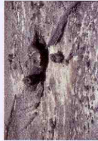
Temporary impact of wildfire on plants and animals.

Like an unwanted wildfire, noxious weeds can drastically affect wildland plant and animal communities, damage watersheds, increase soil erosion, and adversely impact recreation. However, unlike the temporary negative impacts of wildfire, ecological damage from extensive noxious weed infestations is often permanent. Lands affected by wildfire are self-healing, whereas lands invaded by noxious weeds don't return naturally to their pre-invasion condition. Weeds continue to spread and the damage worsens.